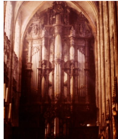
Cathedral s'Hertogenbosch, Netherlands

follow the banding of the light from lower left to upper right.