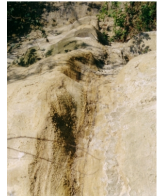
Cliff Face, Dover, UK